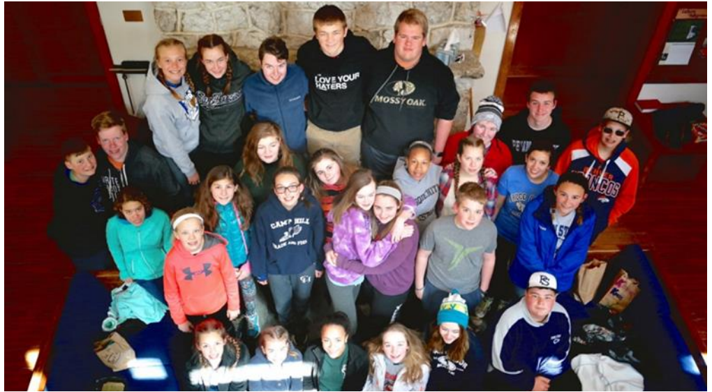
Here's our awesome Youth Group at its April Spring Retreat at Camp Nawakwa. YG is always looking for more youth to join in. Come out with your friends on Sunday, May 1, from 6-8:30 pm for YG Outside Nite. Keep updated by visiting http://www.trinitycamphill.org/YG/index.htm .