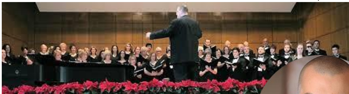
Pennsbury Community Chorus at its Winter Concert

This concert is the last in Trinity's 2015-16 Concert Series. Get tickets for $10 at the church office or at the door. The first 100 Concert Series Patrons can receive free tickets by contacting the