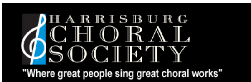
Harrisburg Choral Society: founded in 1865