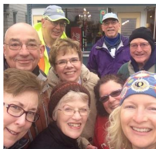
March 19: All warmed up after the first walk/run of 2016

Meet at 8:20 for devotions at the peace pole outside the front entrance. Then head out at 8:30 for a 30-minute walk or run, your choice. Later, anyone can meet for coffee and breakfast at a cafe in town. Questions? Contact kathyholmes@mac.com . Or join the Facebook group, Trinity on the Run .