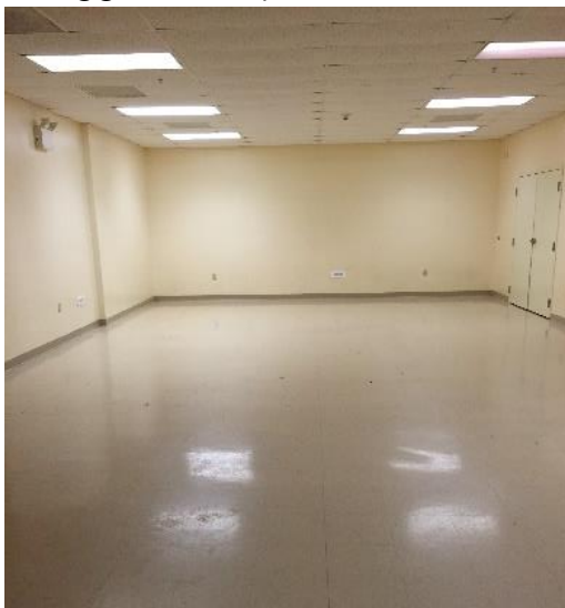
The homeless men arrange their mattresses on the floor around the perimeter of this room and put the mattresses away in the morning. Volunteers bunk in a small separate room in their own sleeping bags.

With the advent of spring, the emergency winter shelter for homeless men (Susquehanna Harbor Safe Haven, near the Farm Show Building in Harrisburg) is closed. It re-opens in October, so potential Trinity volunteers have months to think about taking a turn. It's been a recruitment struggle, so maybe the information here will help folks feel more at ease next time around.