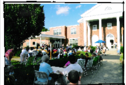
Concert held indoors in the event of inclement weather.

Concerts 6:30 - 7:30 p.m. outdoors on church grounds