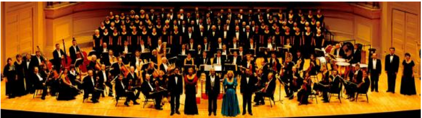
Kyiv Symphony Orchestra and Chorus at Carnegie Hall