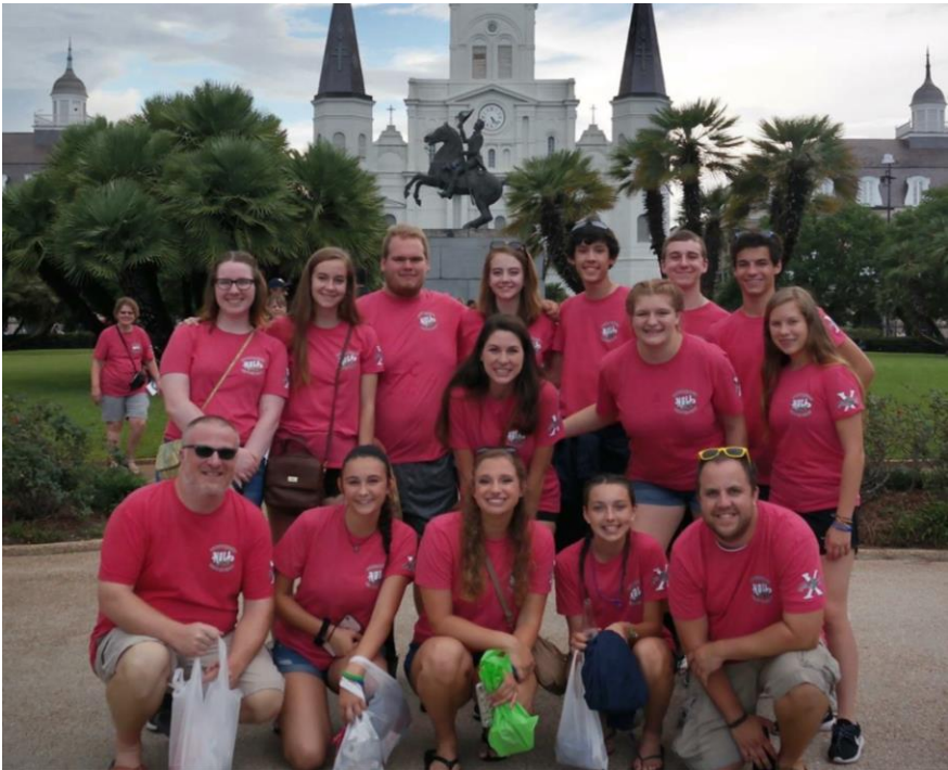
Our Sr. High Youth Group on its mission trip to New Orleans, July 8-16.